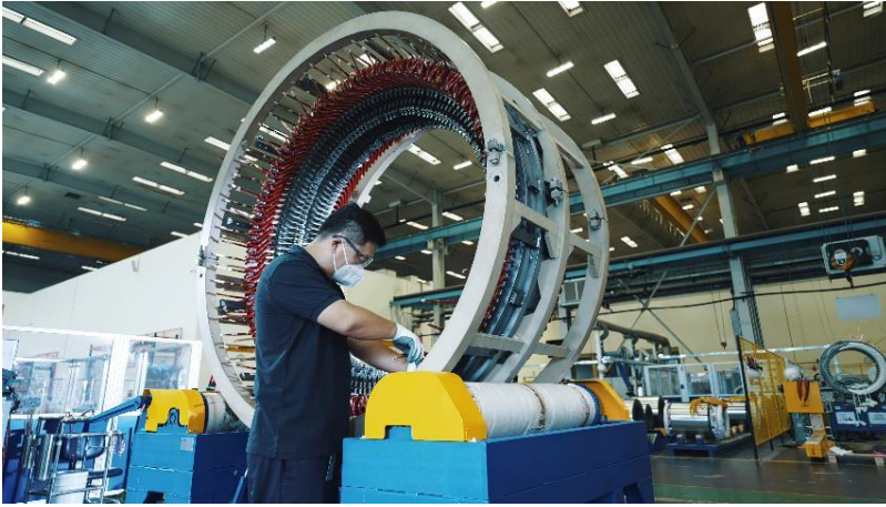
Gearbox (top) and generator (bottom) in the Winergy assembly halls.