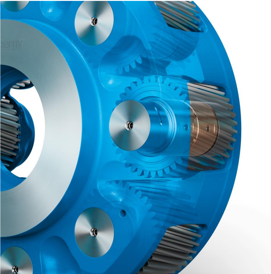
Second-generation journal bearings are part of the technology package.